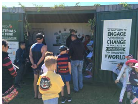
GECA's Materials In Mind pod at the Randwick Eco-living Expo Sept. 2018

Editorial across a number of publications and a strong dedicated effort on social media, further increased our communications and audience reach.